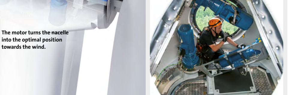
Each rotor blade has its own pitch control system, which aligns the rotor blades individually and serves as a brake and emergency shutdown system.